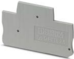
End cover, length: 68 mm, width: 2.2 mm, height: 39.6 mm, color: gray

Please be informed that the data shown in this PDF Document is generated from our Online Catalog. Please find the complete data in the user's documentation. Our General Terms of Use for Downloads are valid ( http://phoenixcontact.com/download )